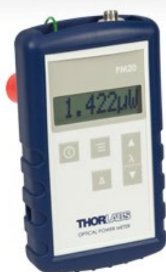
PM20A Fiber Optic Power Meter