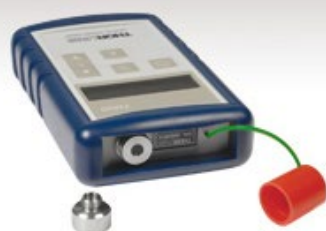
PM20 Power Meter with Fiber Adapter Removed