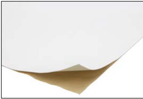
PMR10P1 33 cm x 33 cm Sheet with Adhesive Backing