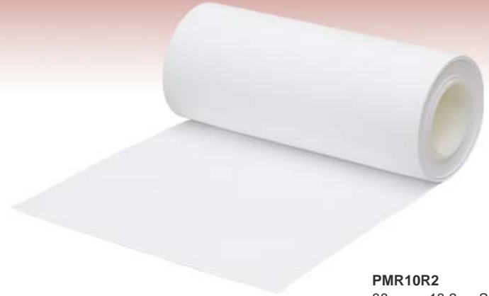
PMR10R2 33 cm x 13.2 m Sheet