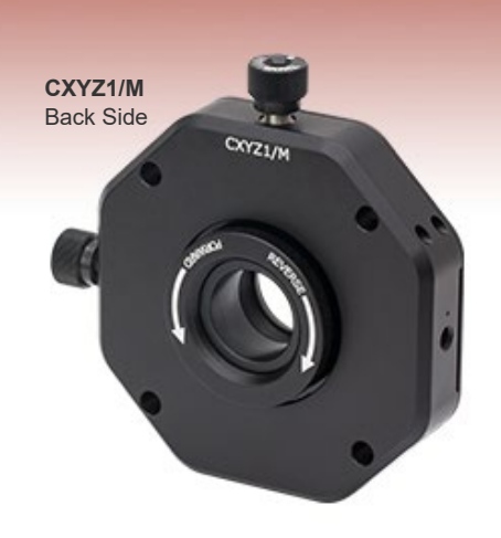
Knurled Dial Translates Optic Cell Along the Z-Axis