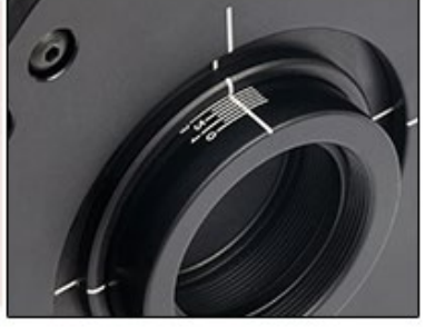
Tick Marks at 0.25 mm Intervals Indicate How Far Along the Z-Axis the Optic Cell has been Translated