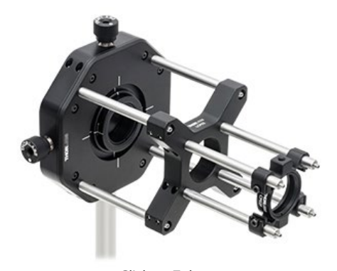
Click to Enlarge [APPLIST] [APPLIST] The CXYZ1(/M) can Easily be Adapted to a 30 mm Cage System Using the LCP02 60 mm to 30 mm Cage Plate Adapter

the zoom adjustment dial on the back of the mount. The optic cell