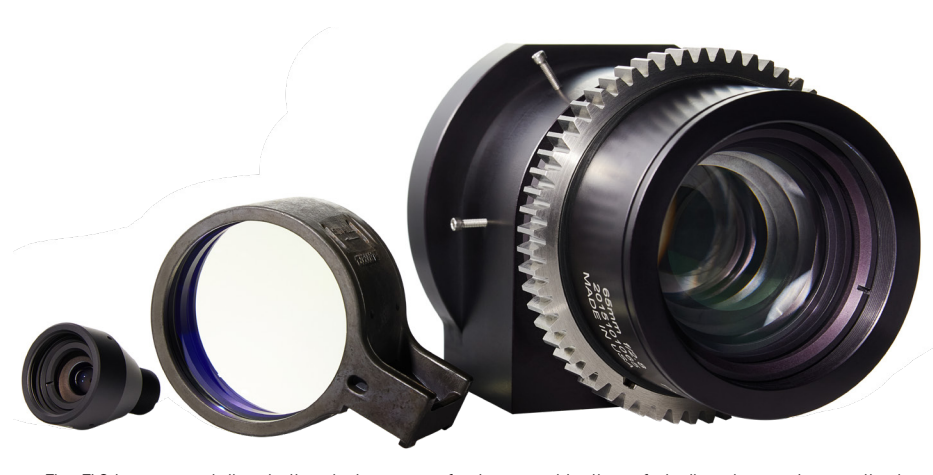
The TLS team specializes in the design, manufacture, and testing of challenging custom optical components and assemblies.

Operating as an R&D and production facility, Thorlabs Lens Systems (TLS) offers precision-engineered custom optics solutions. Located in Rochester, NY, the epicenter of one of the most significant and vibrant optics communities in the United States, TLS provides in-house optical and optomechanical design, rapid