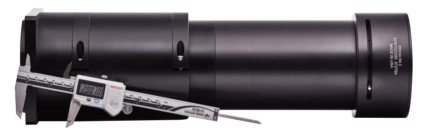
Custom optical assemblies can be prototyped and manufactured in a fraction of the standard industry lead time.

With manufacturing cells dedicated to generating, grinding, and polishing each glass type, we are able to quickly execute to meet various customer needs.