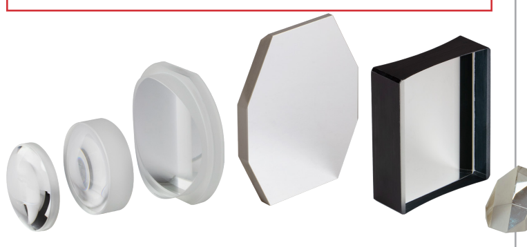
Our Rochester-based group specializes in the glass manufacturing of cylinders, asphericals, sphericals, and plano/flats.